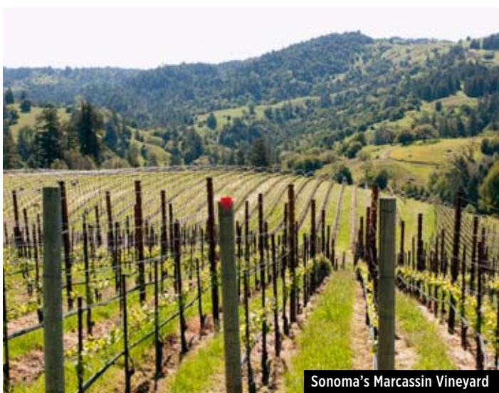
Sonoma's Marcassin Vineyard