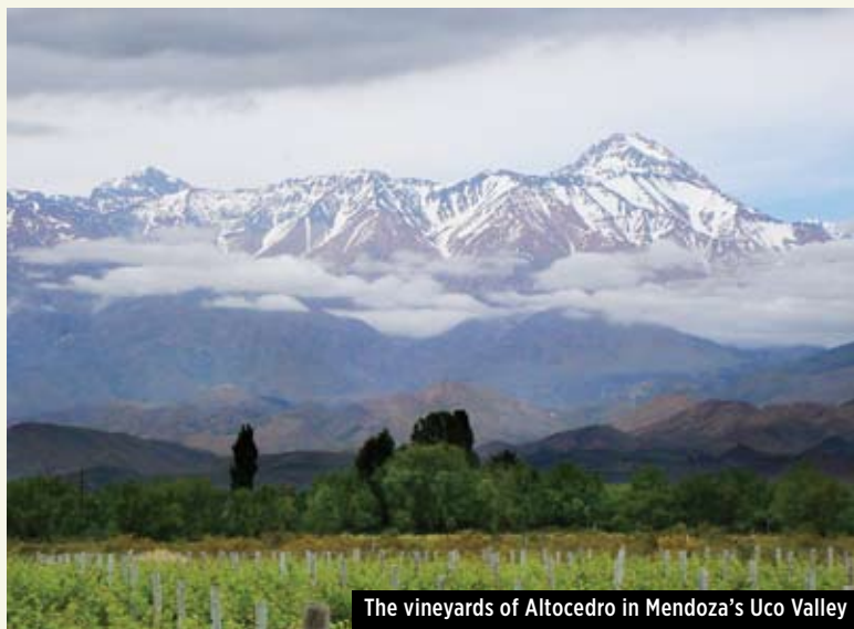
The vineyards of Altocedro in Mendoza's Uco Valley

It is, however, a buffet of outstanding and classic expressions in California Cabernet Sauvignon, Cabernet Franc, Pinot Noir and Chardonnay, from benchmark producers like Paul Hobbs and Marcassin, that take top honors among the Hot Wines, on page 4.