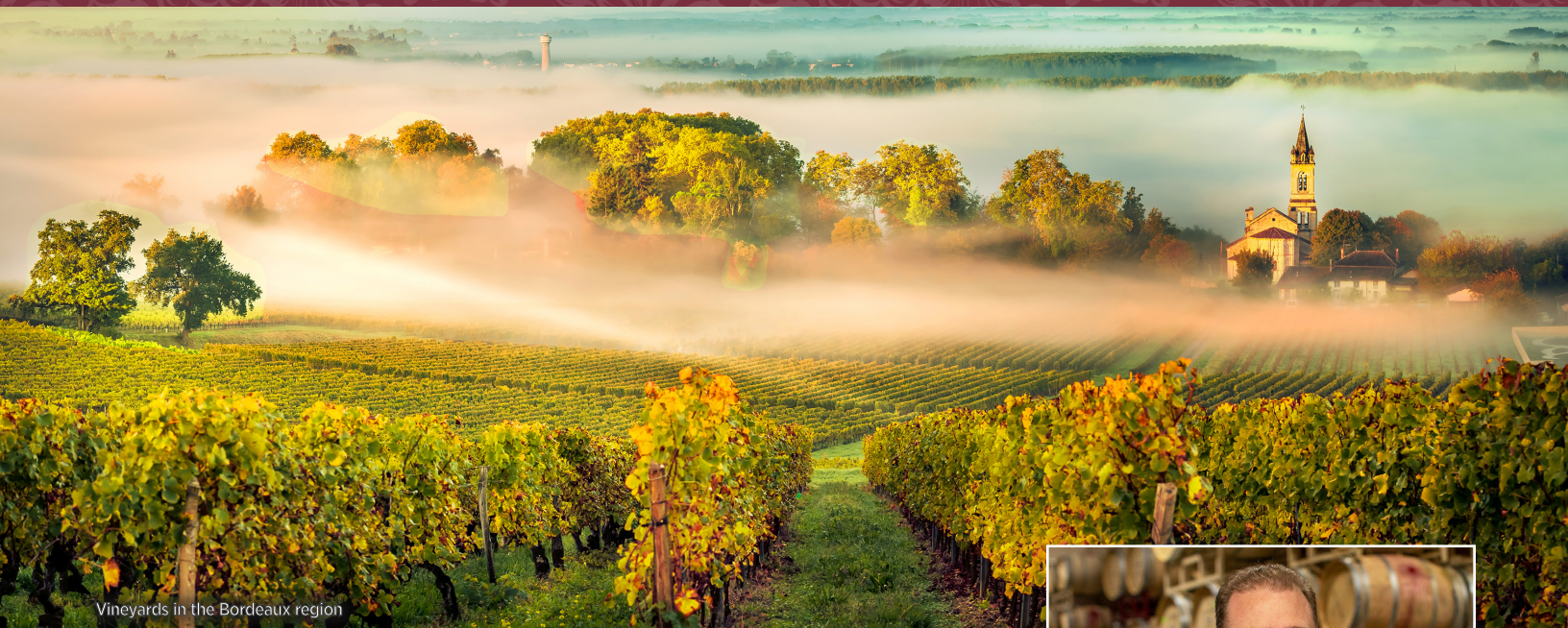
Vineyards in the Bordeaux region

Uncork local traditions, savor intense flavors and enjoy palate-pleasing adventures during an AmaWaterways Wine Cruise